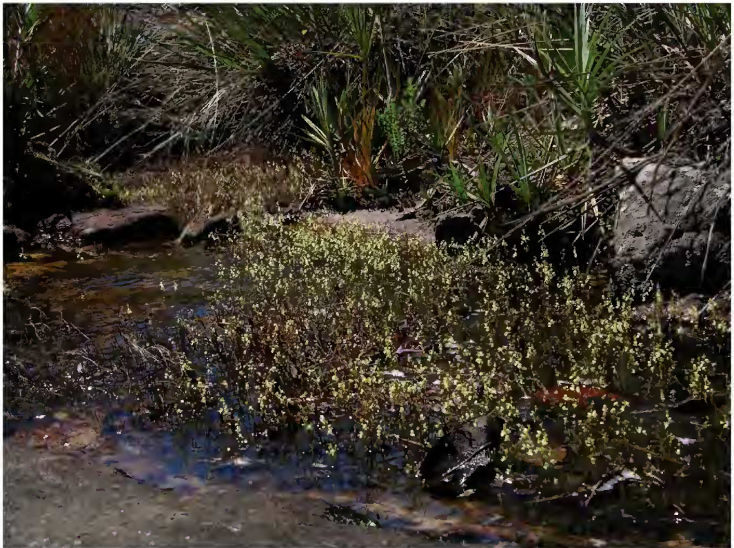
Figure 2: Utricularia neottioides growing in a small stream in the Serra do Cabral, Minas Gerais, Brazil.